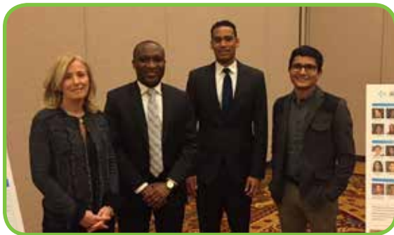
Three scholarship recipients shared their stories at an Ernst & Young sponsored luncheon at the CAS Annual Meeting, raising $4,300 for the Actuarial Diversity Scholarship and the International Association of Black Actuaries Scholarship.