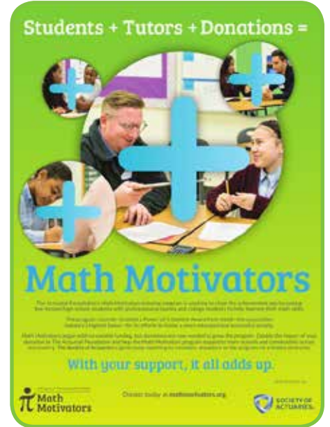
Raised $128,922 in the first year of the Society of Actuaries Math Motivators Matching Gift Campaign.