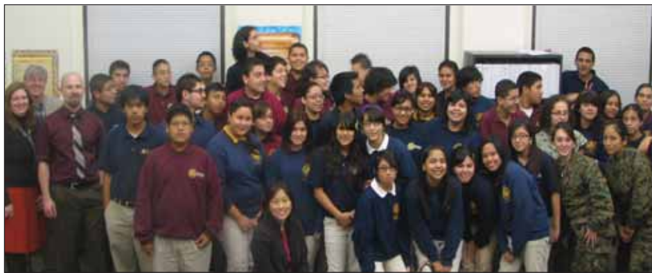
Pritzker College Prep Math Teams

Gary Comer College Prep (Chicago, IL) Noble Network Charter School