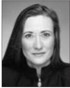
Managing Director, Towers Perrin, NY

Welcome to our new Board of Trustee volunteers whose three-year terms began January 1, 2004. We are honored to have their expertise and enthusiasm working on the Foundation's behalf.