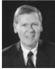
Consulting Actuary, Milliman USA, NY

The Foundation appeals to me as a way in which to provide financial support for actuaries helping our society in ways that they can do