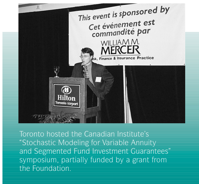
Toronto hosted the Canadian Institute's "Stochastic Modeling for Variable Annuity and Segmented Fund Investment Guarantees" symposium, partially funded by a grant from the Foundation.

financial literacy curriculum designed to empower students to responsibility for their financial futures. The actuarial contribution to the project, made possible by a $100,000 grant from Milliman & Robertson, will be a secondary school curriculum specifically examining the concepts of risk and risk management.